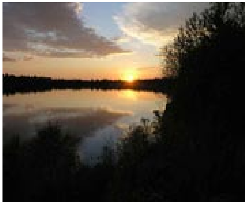
Lake Wazee sunrise